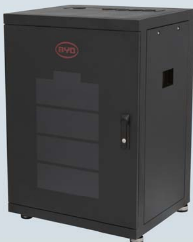
B-Box Pro 2.5~10.0